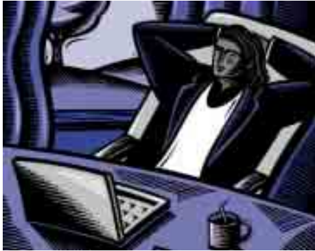
Engineering continued from page 7.