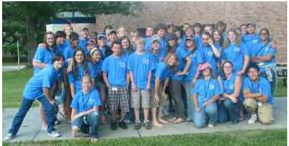
SUNY Jamestown Community College NYGEAR UP rising 11th grade students pose with others attending the Summer College Access Academy at SUNY Jamestown CC during the summer of 2009.