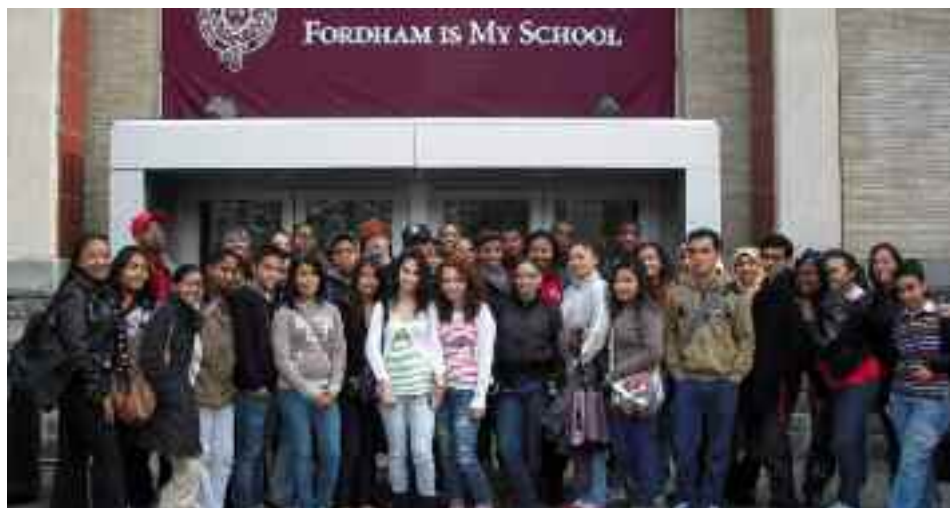
St. John's University NYGEAR UP and GEAR UP students visit the campus of Fordham University during the clcu Latino College Fair on November 21, 2009.

My host family helped to make my stay memorable. We visited amusement parks, saw the top of a mountain, and shared stories with one another that made us laugh. I enjoyed festivals, parties, and was able to immerse myself in Japanese culture. When it came to say goodbye, I was sad to realize that I would not see nor live with them again in a long while. I am thankful for the opportunity to travel abroad and experience life in a totally different way.