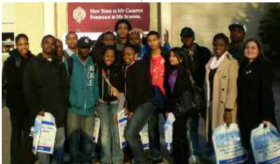
Long Island University NYGEAR UP students visit the Rose Hill campus of Fordham University during the Commission on Independent Colleges and Universities' (cIcu) Latino College Fair on November 21, 2009.

2 students from Richfield Springs CS and 1 student from Owen D. Young CS attended NYSACAC Camp College at Hobart and William Smith Colleges; 2 students from South Kortright CS, 2 students from Stamford CS, and 2 students from Jefferson CS went to NYSACAC Camp College at Marist College. All of the students were rising 11th graders who very much enjoyed the experience.