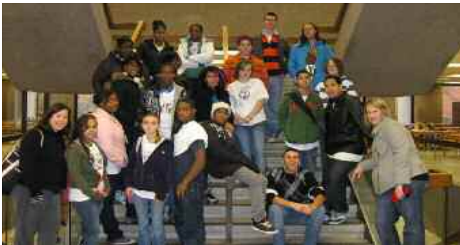
Syracuse University NYGEAR UP Institute of Technology at Syracuse Central High School 9th grade students visit one of Syracuse University's libraries on November 23, 2009.