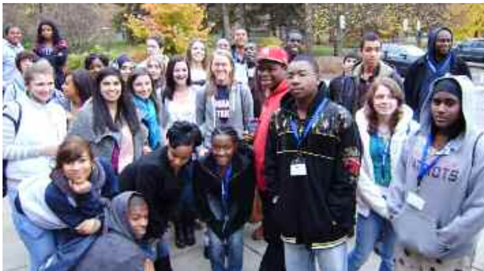
SUNY Binghamton University GEAR UP students arrive at the Rochester Institute of Technology for a tour of the campus in the fall of 2009.

Bronx Institute GEAR UP 11th Grade Student Stories, continued on page 6.