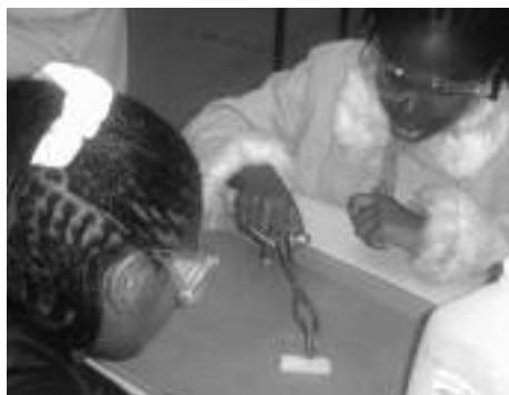
CUNY CSI/Discovery Institute GEAR UP students experiment with dry ice on October 30, 2007.