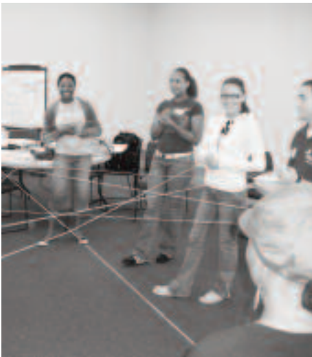
St. John's University GEAR UP staff participate in a team-building exercise during a staff retreat on September 22, 2007.