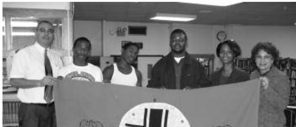
Dowling College GEAR UP students and mentors holding a captured German flag, part of a historical research project at Wyandanch Memorial HS.

“November 16, 2007, was one of the most amazing experiences of my life. I was able to see the extraordinarily beautiful Yale University campus. Walking around the campus, meeting Yale students, especially one from Yonkers, and visiting the dorms, made me feel like I was actually a student attending Yale. Hopefully, Yale will be seeing me very soon....in about 3 years.”