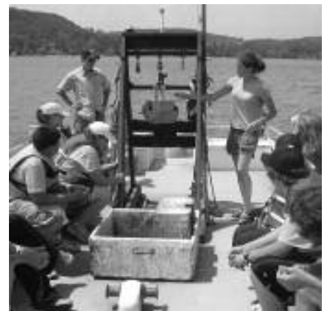
SUNY Cobleskill GEAR UP students sample the bottom of Otsego Lake during a visit to the SUNY Oneonta Biological Field Station.