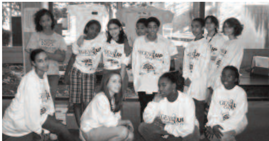
Albany CSD NYGEAR UP students visit SUNY Hudson Valley Community College.

Purpose: To educate students about the benefits of college, preparing for college, and the various fields of study they could pursue at either SUNY MVCC or other colleges. These fields included business, technology, medicine and health care, human services, and hospitality.