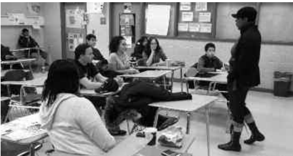
In spring of 2010, St. John's University GEAR UP students attend a College Readiness workshop to learn about the applications process and financial aid at Long Island City HS.

– A SUNY Nassau Community College GEAR UP student