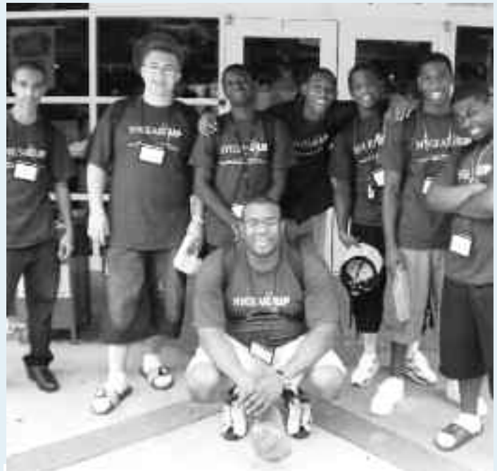
City School District of Albany NYGEAR UP students at Morehouse College during the 2010 African-American Heritage College Tour.