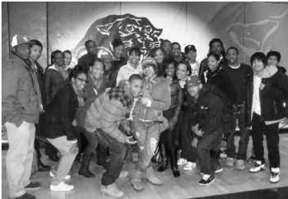
Long Island University NYGEAR UP 11th grade students from Benjamin Banneker Academy and Science Skills Center High School enjoy a tour of SUNY College at Old Westbury on March 12, 2010.

NYGEAR UP 11th grade students and their families attended this college fair, held at New Rochelle High School, with opening remarks in the Daniel F. O'Brien Gymnasium. Over 60 colleges and universities were represented. Students also attended panel discussions on finding the right fit in a college; public and private colleges; the admissions process at highly selective colleges; STEM colleges and universities; and resources for college-bound students with disabilities.