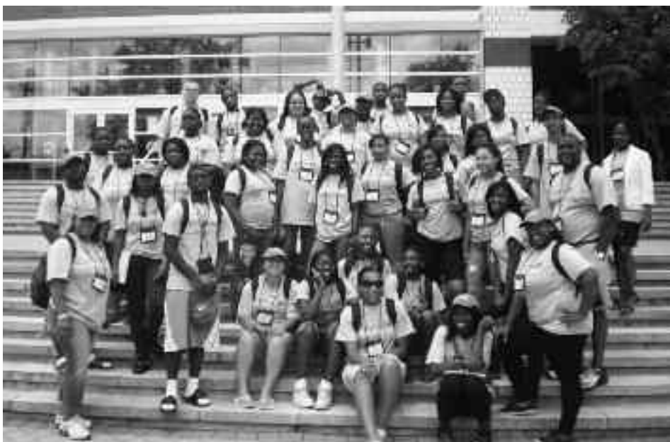
City School District of Albany NYGEAR UP students visit the Robert W. Woodruff Library at Clark Atlanta University during the 2010 African-American Heritage College Tour on June 28-July 1, 2010.

This curriculum, developed by members of the National Association for College Admission Counseling, is presented in three manuals for middle school students (grades 7 – 8), early high school students (9 – first semester of 11), and late high school students (11 – 12). A Guide for Parents is available in English and Spanish, as is a downloadable PowerPoint presentation.