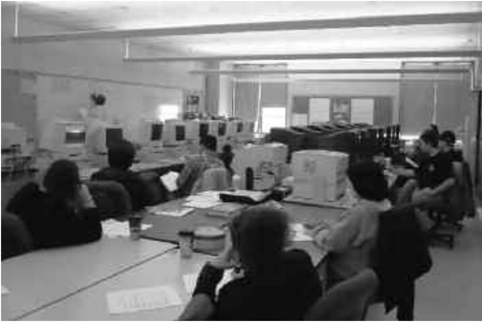
Parents of St. John's University GEAR UP students learn about computers during a workshop at Long Island City HS in the spring of 2010.

experienced living on a real college campus, gained more knowledge about Web design than I could ever imagine, but most of all, I gained the experience of a lifetime. I was awarded two awards, one for my Web site and one for camper of the week.