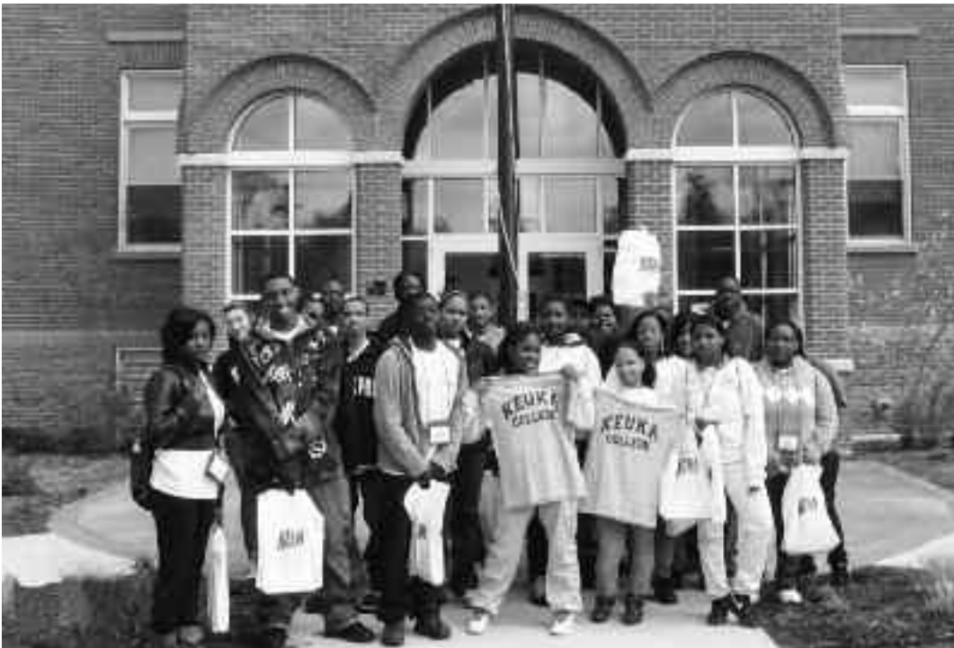
NYGEAR UP students from City School District at Albany tour Keuka College on April 9, 2010, during the Commission on Independent Colleges and Universities' College Quest.

Contact: Cathleen Patella (315) 364-3289 fax (315) 364-3227 cpatella@wells.edu