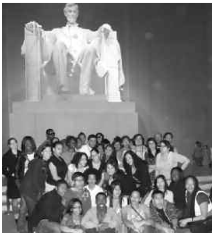
St. John’s University GEAR UP students visit the Lincoln Memorial during a trip to Washington, D.C. on April 1, 2010.