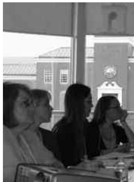
Attentive students participate in a session on financial aid at the May 4, 2010, cIcu/College Board PDW at Hartwick College.