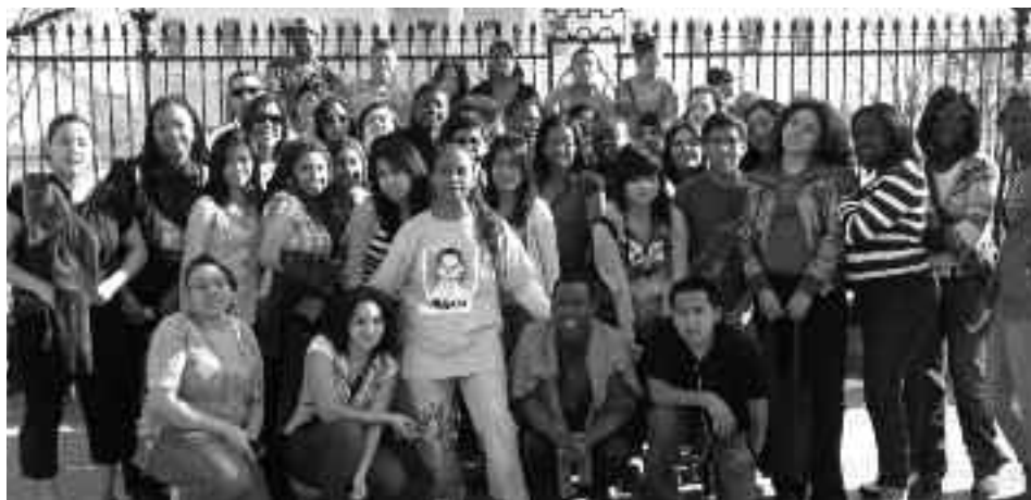
St. John's University GEAR UP students pose in front of the White House during a trip to Washington, D.C. on April 1, 2010.