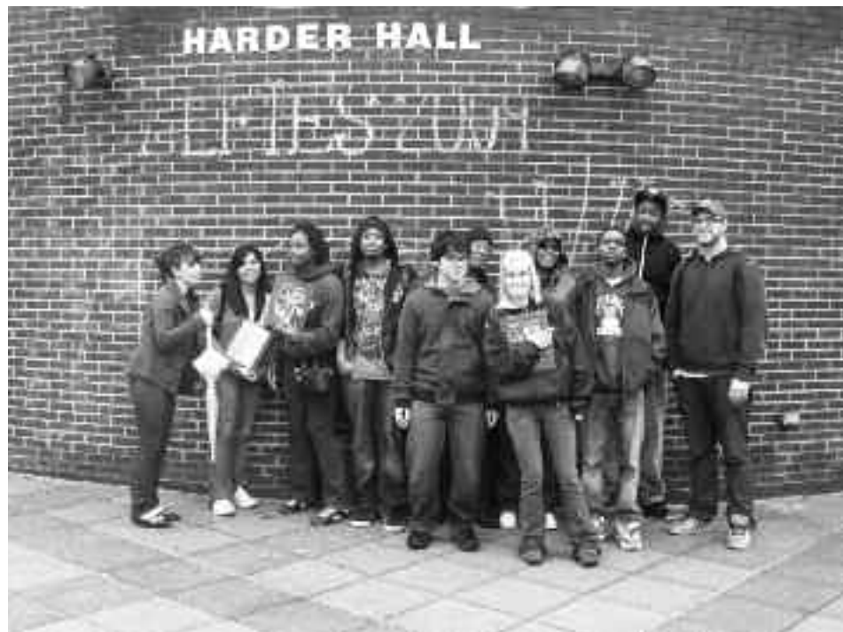
SUNY Binghamton 10th and 11th grade GEAR UP students pose in front of Alfred University's Harder Hall on March 23, 2010.

All 10th grade Binghamton HS students taking Earth Science reinforced what they learned with a hike and lunch at Buttermilk Falls State Park in Ithaca, New York.