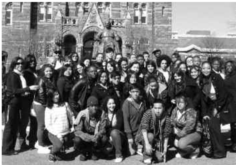
St. John's University GEAR UP students visit the campus of Georgetown University in Washington, D.C. on March 31, 2010.