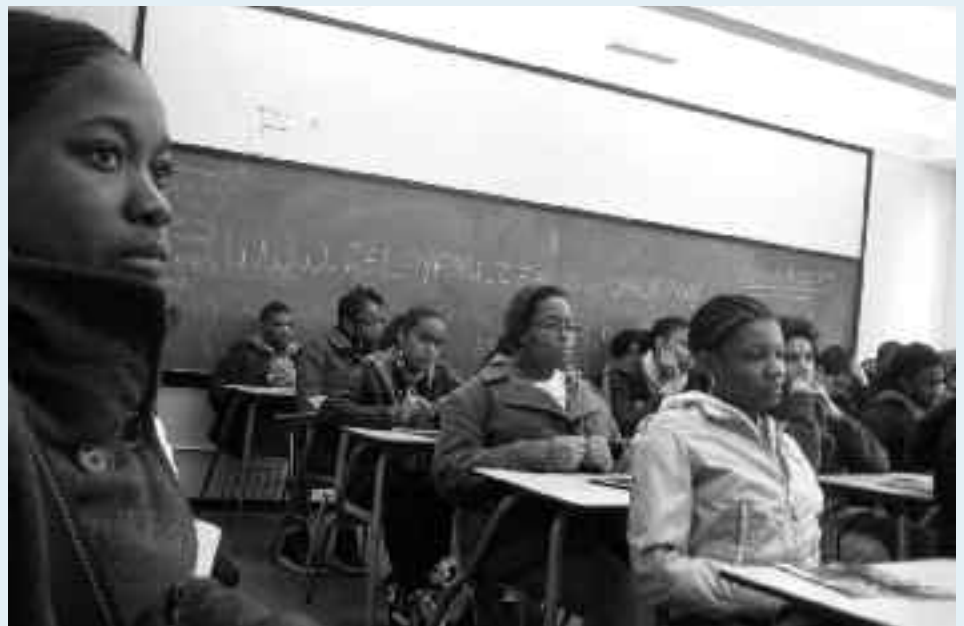
Long Island University NYGEAR UP 11th grade students from Benjamin Banneker Academy and Science Skills Center High School gather in a SUNY University at Albany classroom during a tour of the campus on March 16, 2010.

I loved it. I really loved it. It was something new, something exciting. For the next week I was doing what I loved and by the end of the week I had a fully functioning Web site. By the time the week came to an end, I made new friends,