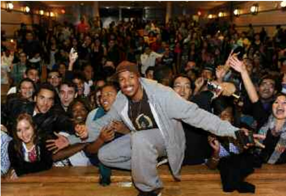
Comedian, actor, and rapper Nick Cannon entertains and inspires St. John's University NYGEAR UP and GEAR UP students at Long Island City High School on October 15, 2010.

learned through NYGEAR UP, I have now successfully applied and have been accepted to SUNY Morrisville State College. This is the college I dreamed of going to and they made it possible.