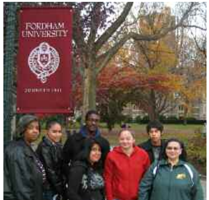
Dowling College GEAR UP students from Wyandanch Memorial High School attend the Commission on Independent Colleges and Universities' (Clcu) Latino College Fair at Fordham University on November 20, 2010.

GEAR UP has definitely helped to create a college-going culture in the district. With their assistance, we have more students taking the PSAT, the SAT, and receiving Regents exam assistance. We have students getting exposure to their future career goals now.