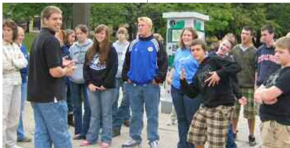
SUNY Cobleskill GEAR UP students visit the campus of SUNY Morrisville State College during the summer of 2010.