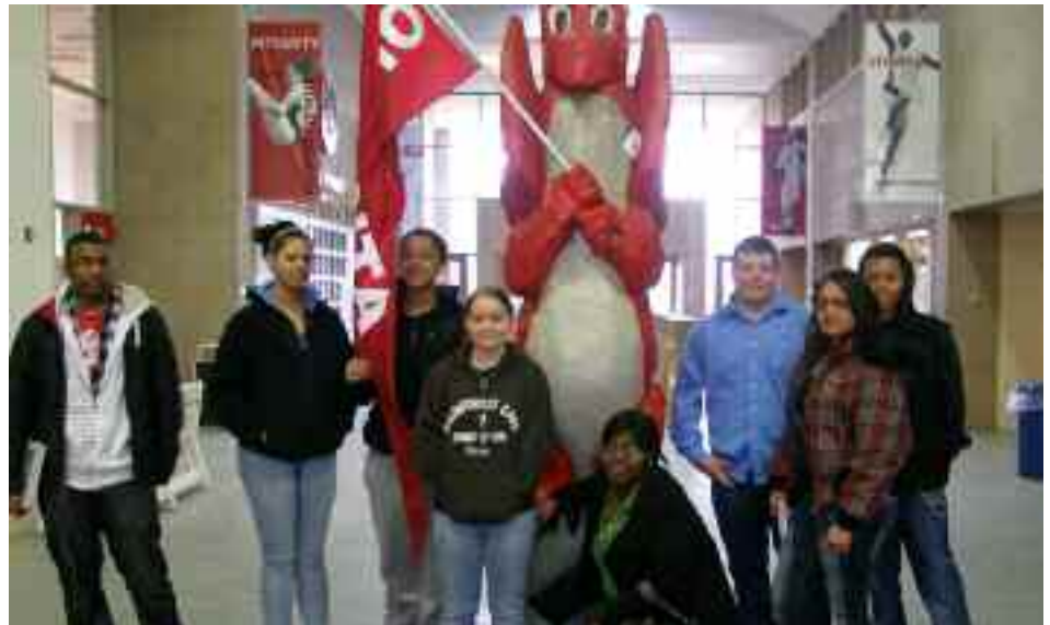
SUNY Binghamton University GEAR UP students from Binghamton High School visit SUNY College at Oneonta on March 16, 2011.

The most meaningful thing they have done was care. Whether it's problems at home or in school, you could stop in and get a person willing to listen.