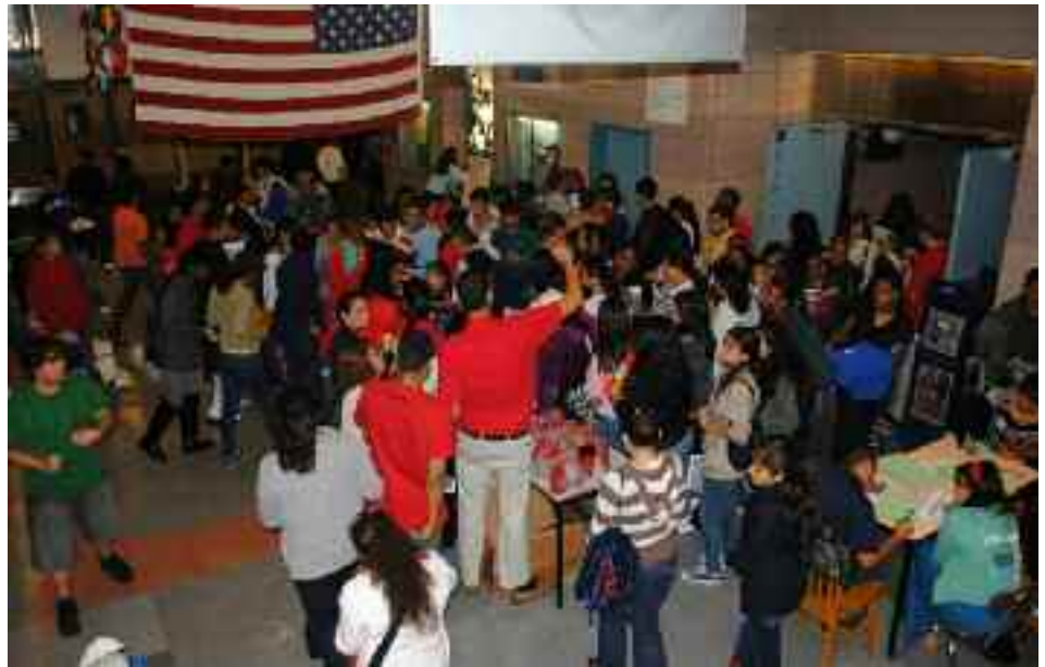
St. John's University NYGEAR UP and GEAR UP students enjoy a "Back to School Bash" at Long Island City High School on October 2, 2010.