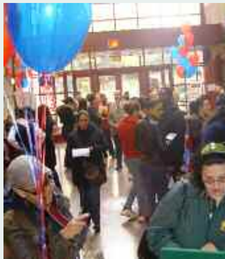
Students and families arrive at Fordham University's Rose Hill campus for the Commission on Independent Colleges and Universities' Latino College Fair on November 20, 2010.

Feedback from students, families, and counselors who attended the Fair reveals that events of this kind are important to help Latino families navigate college options and learn about admissions and the availability of financial aid to meet college costs. cIcu will continue to reach out to and plan future events for Latino students.