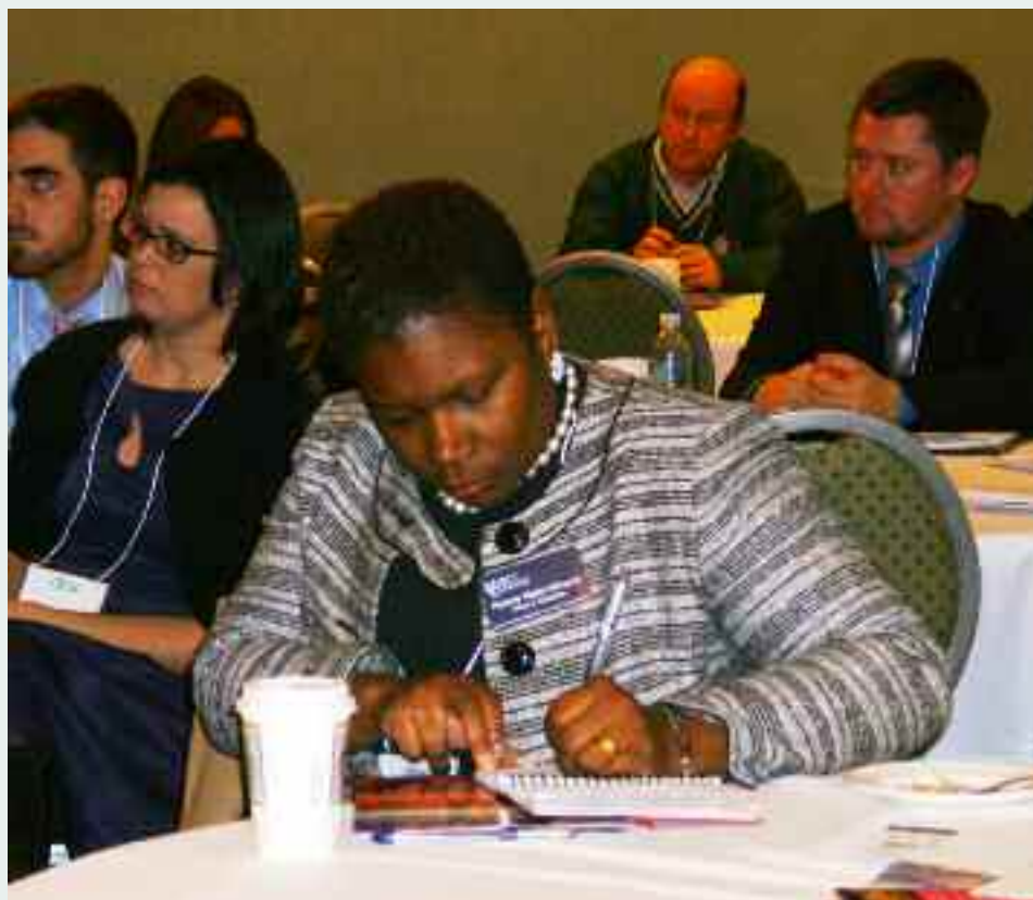
GEAR UP staff members and school personnel participate in the Professional Development Workshop organized by the Commission on Independent Colleges and Universities and the College Board on December 8, 2010.

Feedback was extremely positive, with more than 90% of the attendees either “satisfied” or “very satisfied” with the PDW as a learning experience and as an event that provided them with information relevant to their work. More than 94% called the PDW “well-organized” and more than 88% said that the sessions met their expectations.