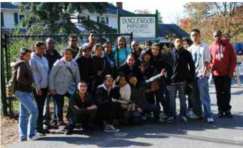
St. John's University NYGEAR UP and GEAR UP students visit the Tanglewood Preserve in Rockville Centre, NY on October 30, 2010 as part of a day of community service.