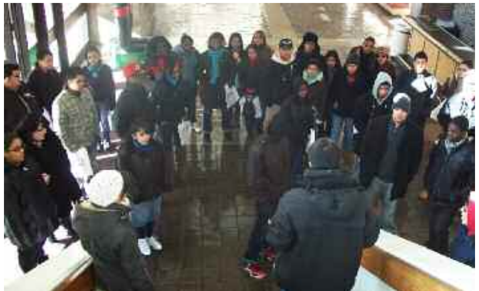
12th grade CUNY Brooklyn College Community Partnership NYGEAR UP students from Bushwick High School for Social Justice visit SUNY Stony Brook University on December 8, 2010.

NYGEAR UP has helped open my eyes to the college experience. They have given my life direction and hope. They have helped me gain not only the knowledge needed, but the inspiration to try for the colleges I want to go to. Thanks to the skills I have