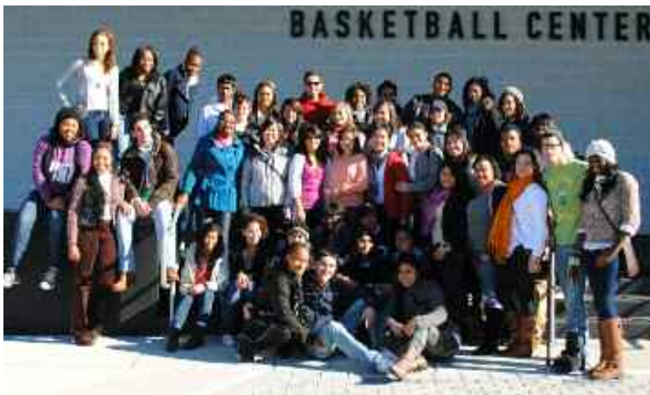
St. John’s University NYGEAR UP and GEAR UP students visit the new Carmelo K. Anthony Basketball Center at Syracuse University on November 12, 2010.

ARIS is the New York City Department of Education’s Achievement Reporting and Innovation System. At this workshop, parents and guardians of Dreyfus IS 49 students received a temporary password and learned how to use the Parent Link Web site which provides information about attendance, progress in school, and how to help children succeed academically.