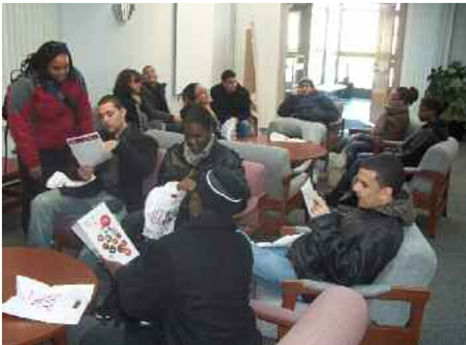
12th grade CUNY Brooklyn College Community Partnership NYGEAR UP students from Bushwick High School for Social Justice visit SUNY Stony Brook University on December 8, 2010, where they received information about the university.

In 10 years I envision myself having a life of success, happiness, and wisdom. In a decade's time I hope to have traveled a lot and seen many different and amazing places in the world, and explore my art through these places. Additionally, I would like to have my art work in an art gallery or a museum by then. I want to be able to live off of my art and have