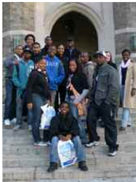
Long Island University NYGEAR UP 12th grade students visit Fordham University during the fall of 2010.