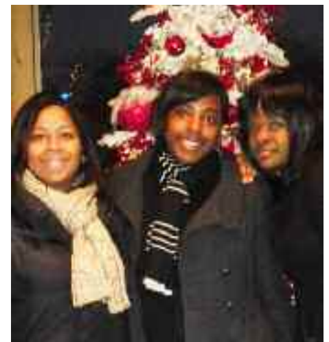
City School District of Albany NYGEAR UP students go caroling at the Teresian House in Albany NY on December 20, 2010.