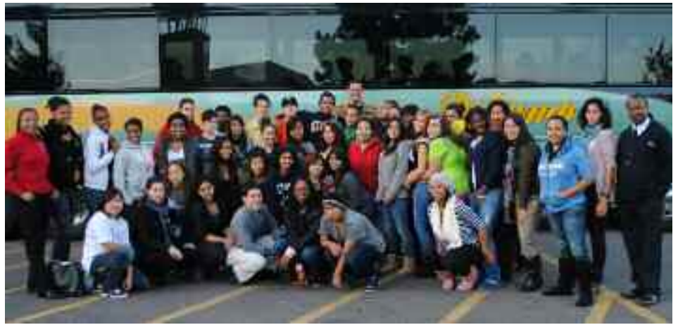
St. John's University NYGEAR UP and GEAR UP students prepare to board their bus on November 13, 2010, during a tour of 6 colleges and universities in upstate New York.

My GEAR UP Project Associate has mentored me in so many different areas. She helped me to learn about colleges and has given me advice about planning my academic courses (what to take and when), improving my grades and looking for summer jobs and internships. She just recently helped me with my school transcript. We looked at my transcript together, and learned that I was missing some credits that I had earned in my previous school. She helped me fix this problem. If it weren't for my Project Associate taking the time out to teach me how to read a transcript, I would not have realized I was missing credits probably until my senior year of high school when it was time for me to apply to college and graduate from high school. When my Project Associate told me I was selected to receive a free laptop because of all the work I'd been doing to take my academics seriously, I thought it was very cool. The laptop has been a great tool for me. I love it. I have been using it to research colleges online and to do my class assignments. I would advise everyone to participate in GEAR UP.