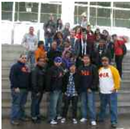
12th grade CUNY Brooklyn College Community Partnership NYGEAR UP students from the Academy of Urban Planning visit SUNY College at Old Westbury on November 15, 2010.

NYGEAR UP 12th grade students visited the ITT Technical Institute's Albany campus and learned about the programs offered.