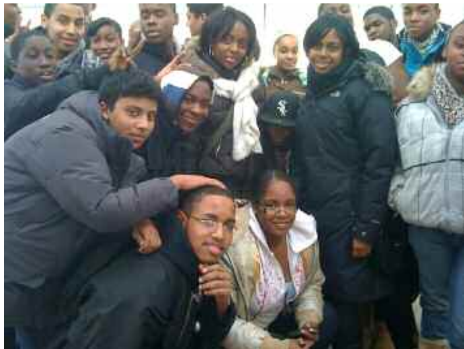
Long Island University NYGEAR UP 12th grade students tour SUNY College at Old Westbury during the winter of 2011.